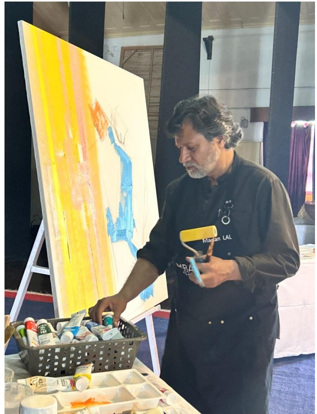
The artist at work